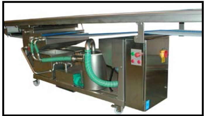
Optional Conveyor Belt Washer

Grote's Sandwich Assembly Conveyor is an all stainless steel unit designed to convey sandwich products over any required length. The top belting is set to a nominal working height for accommodating either manual or automated sandwich assembly processes. The stainless steel top bed is formed with continuous channels along both sides of the conveyor, creating ideal locations for placing sandwich ingredients at each operator workstation. The belting is fully adjustable for tracking correction and is held under tension on the idle side. Simple manual release toggles on the idle side provide slack in the belting to allow easy access for cleaning and drying. Belt speed is electrically adjustable in either manual or automatic modes.