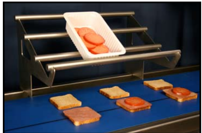
Optional Self Locating Ingredient Tray Racks

Grote's Sandwich Assembly Conveyor can be customized with several optional accessories, including a Belt Wash/Clean In Place (CIP) system. The CIP system provides for continuous washing and drying of the belt during production, and is easily removed for cleaning and sanitation. In addition, the conveyor can be equipped with self-locating racks which can be positioned anywhere along the length of the conveyor. These racks are capable of holding ingredient containers weighing up to 60 lbs, and can be positioned either alongside an operator workstation or cantilevered above the conveyor belt.